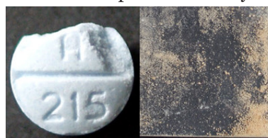
Xylazine has been found in powder residue and counterfeit pain pills.