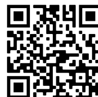
Click or scan for more info.